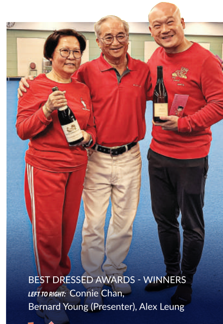
BEST DRESSED AWARDS - WINNERS