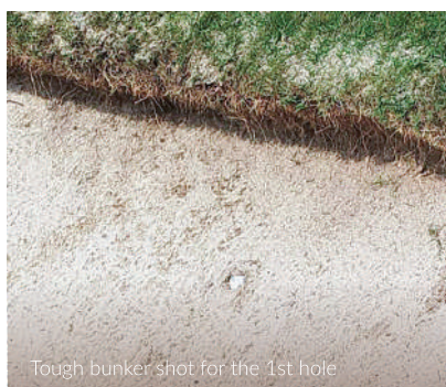
Tough bunker shot for the 1st hole