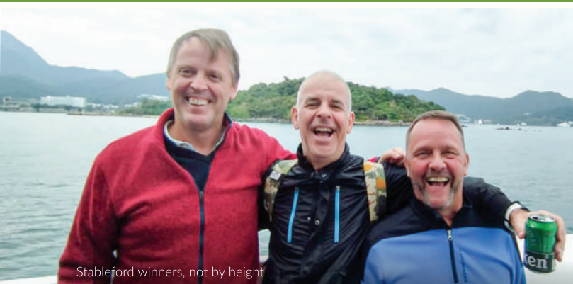
Stableford winners, not by height