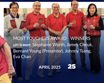
MOST TOUCHERS AWARD - WINNERS